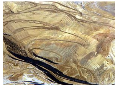
Round Mountain mine