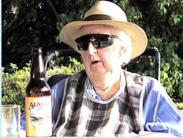
A picnic in the garden with Fervid