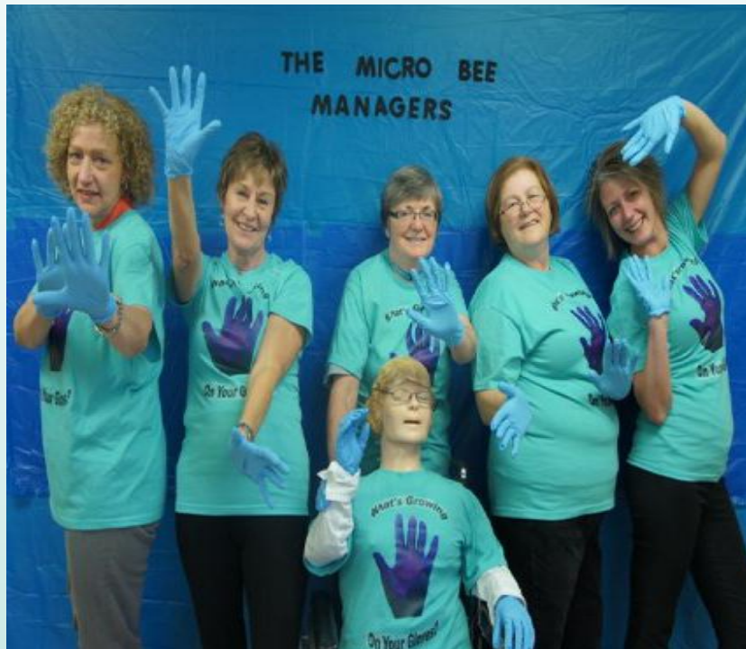
Edmonton General - Edmonton, Alberta