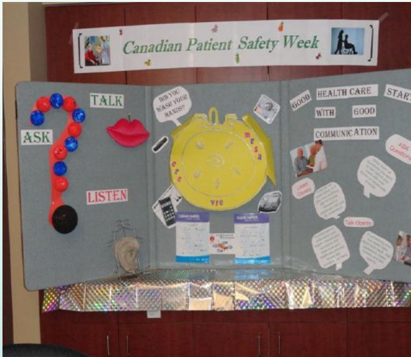
Youville Home – St. Albert, Alberta