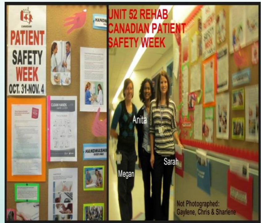
Grey Nuns Community Hospital – Edmonton, Alberta