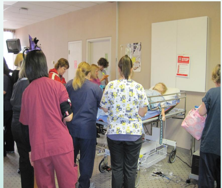
Grey Bruce Health Services – Owen Sound, Ontario