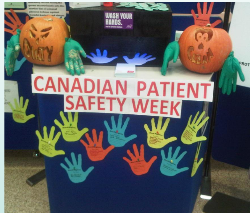
St. Mary's Hospital – Camrose, Alberta