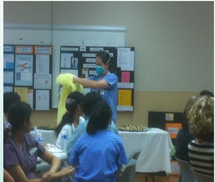
Burnaby Hospital – Burnaby, British Columbia