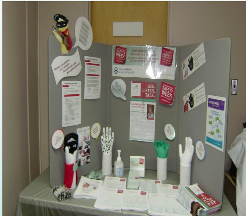
St. Joseph's General Hospital – Vegreville, Alberta